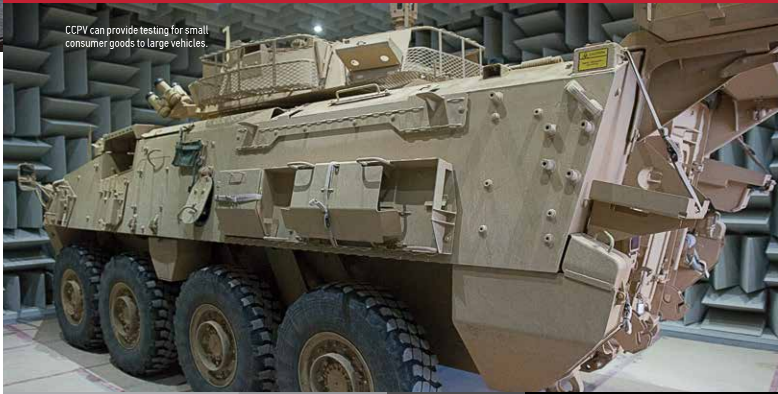
CCPV can provide testing for small consumer goods to large vehicles.

Identified as a key industrial capability, GDLS-Canada makes a significant impact to Canada's innovation ecosystem and economy, sustaining over 13,500 direct and indirect jobs.