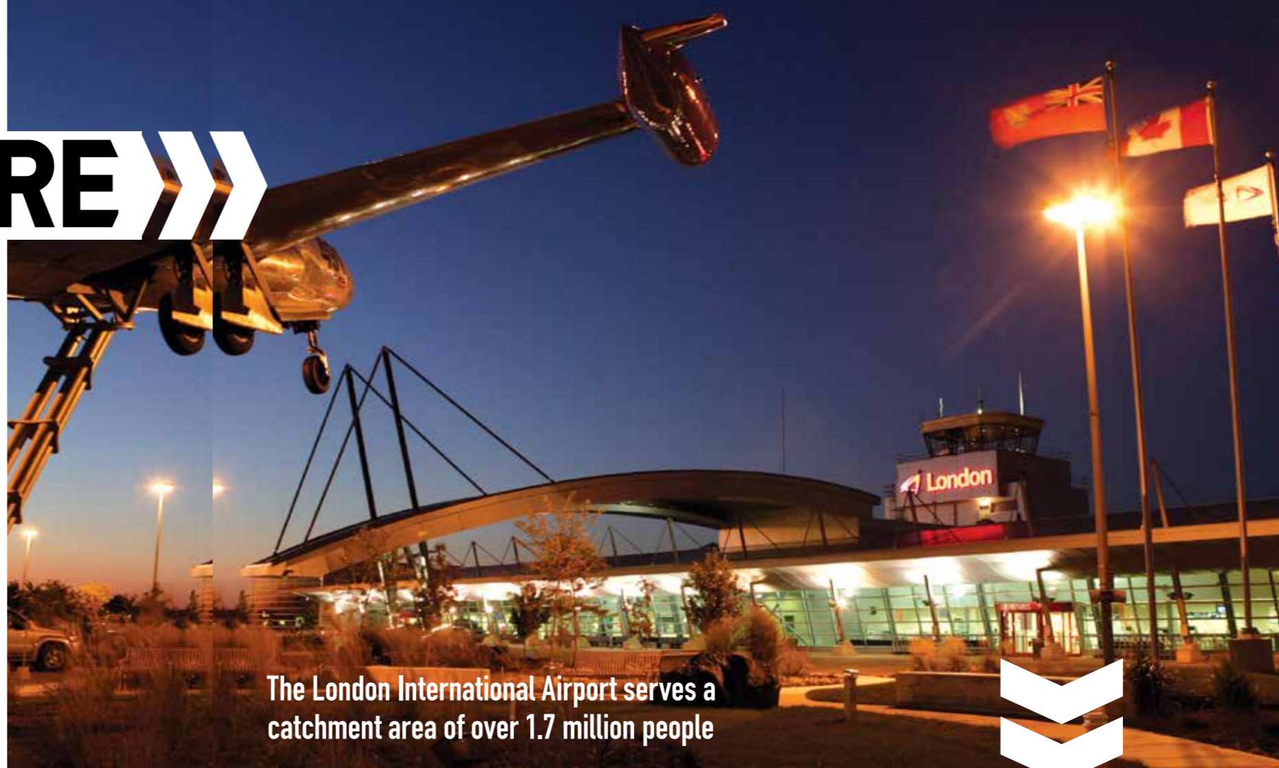
The London International Airport serves a catchment area of over 1.7 million people

City assets are the driving force behind a vibrant business climate in our industrial parks