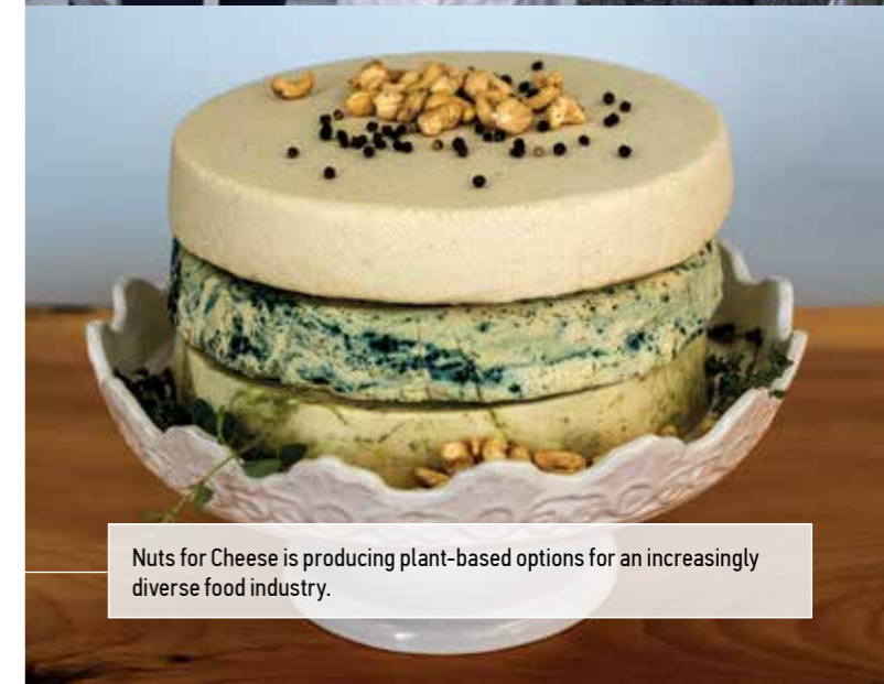
Nuts for Cheese is producing plant-based options for an increasingly diverse food industry.