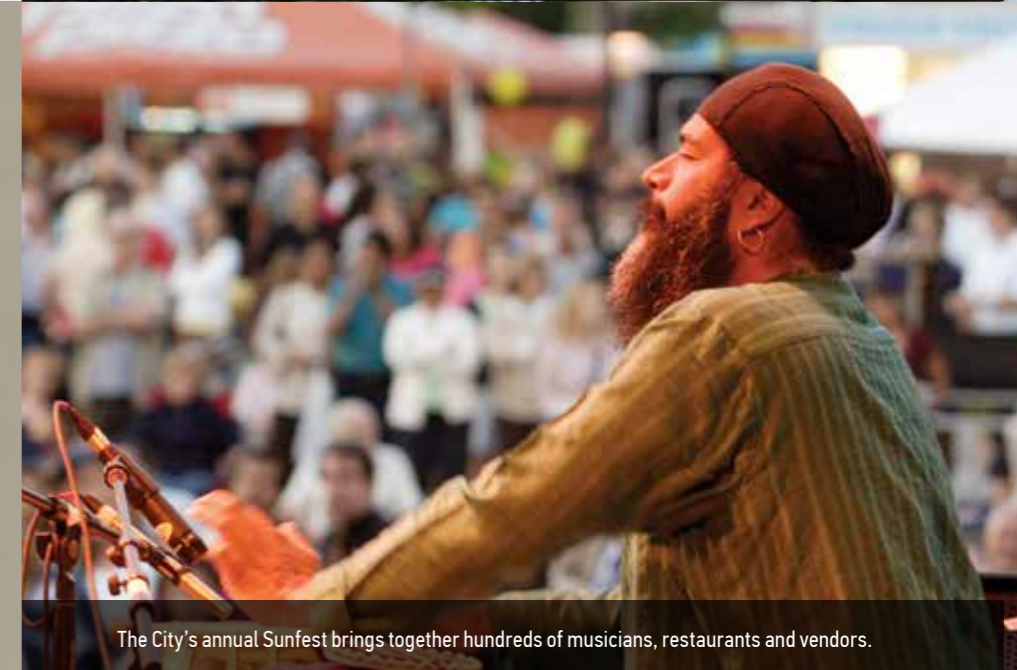
The City’s annual Sunfest brings together hundreds of musicians, restaurants and vendors.