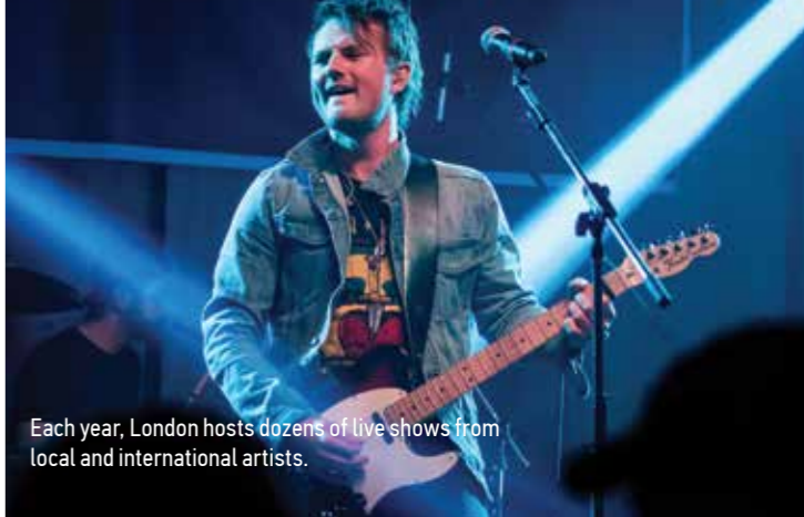
Each year, London hosts dozens of live shows from local and international artists.