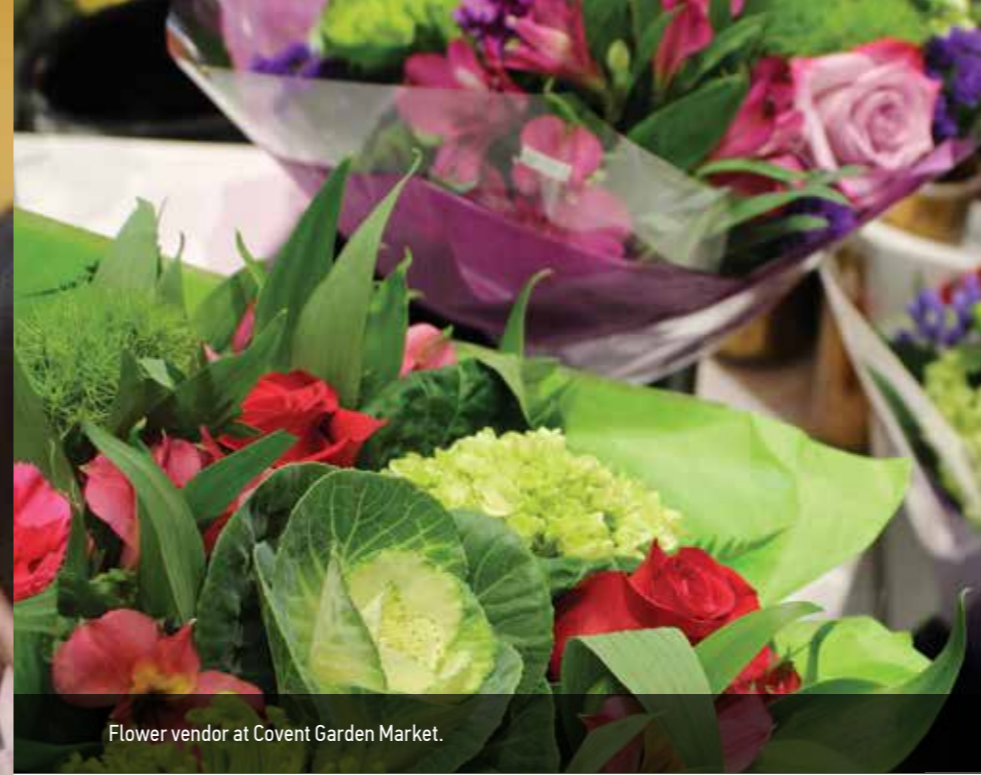
Flower vendor at Covent Garden Market.