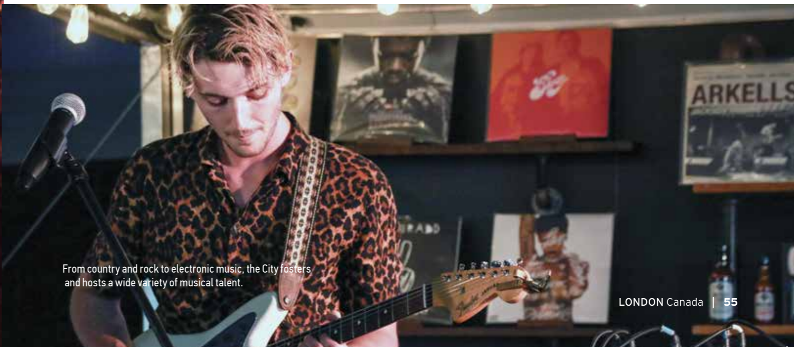
From country and rock to electronic music, the City fosters and hosts a wide variety of musical talent.

With countless opportunities to offer, exploring creative potential, showcasing talent and putting theory to practice are just a few ways London's creative community is strengthening the music sector.