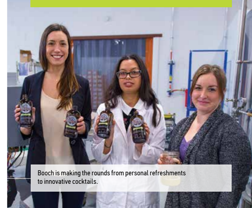
Booch is making the rounds from personal refreshments to innovative cocktails.