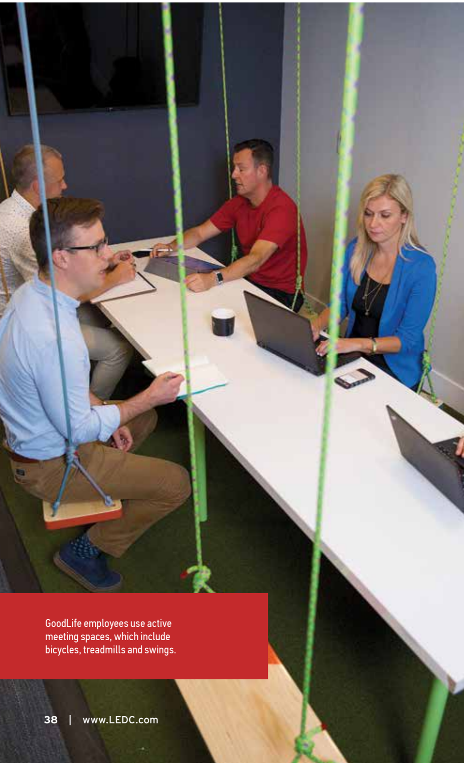
GoodLife employees use active meeting spaces, which include bicycles, treadmills and swings.

WE ARE NOT A TEAM BECAUSE WE WORK TOGETHER... We are a team BECAUSE WE TRUST, RESPECT, AND CARE FOR EACH OTHER