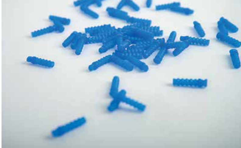
Starlim produces hundreds of thousands of precisely designed and manufactured silicone parts for health care devices throughout the world.