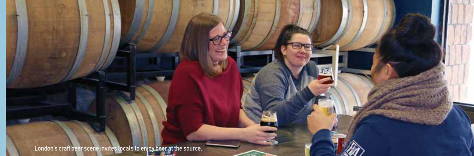
London's craft beer scene invites locals to enjoy beer at the source.

Local brewers know that London has expertise on tap. From Capital Blonde Ale at Forked River, to Rusty Red Sled Amber Ale at Toboggan Brewing Co., an artisan culture is brewing in London. Fostering creativity and connectivity, craft brewers eagerly come together to produce high-quality and unique beer, and to strengthen London's craft brewery scene. Uniting community, arts and entertainment, and locally produced products, this growing local industry creates an experience that Londoners love.